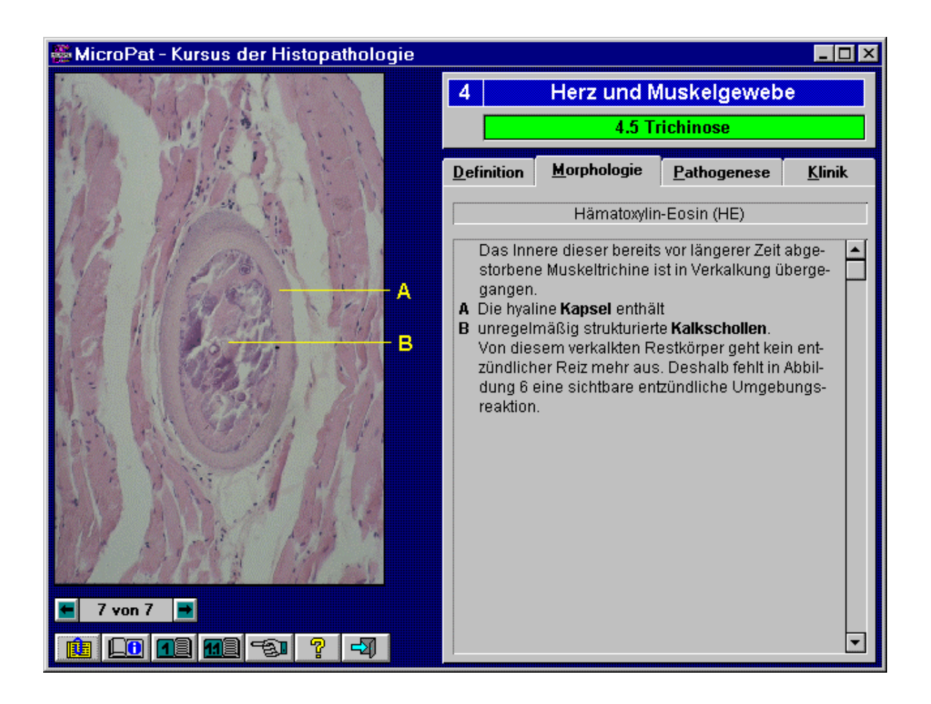
Fig. 1: Page from the histopathological atlas